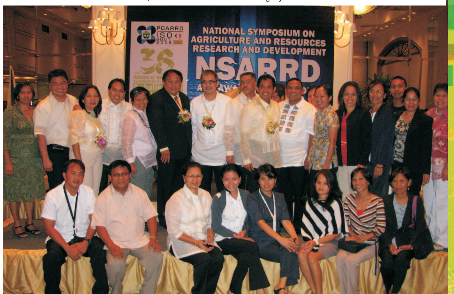
The ViCARP team flank the big winners after the awarding ceremony.