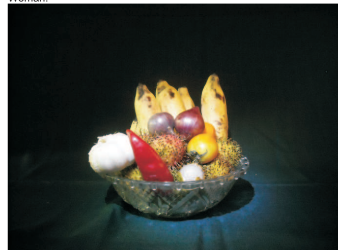
The winning photo of the Table-top photography.