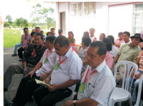
Launching of TG Matag-ob, Leyte is attended by a number of municipal employees and farmers.