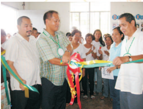
Ribbon cutting marks the opening of the Techno Gabay in Mayorga, Leyte.