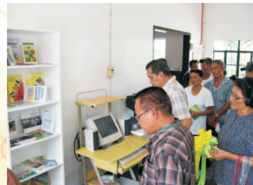
Farmers view the display of IEC materials at the newly launched TG Center in Merida, Leyte.